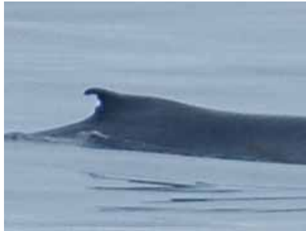
Figure 1. Whale B1069 sighted in Area III on 12 January 2006. The whale was identified by the particular shape of the dorsal fin.