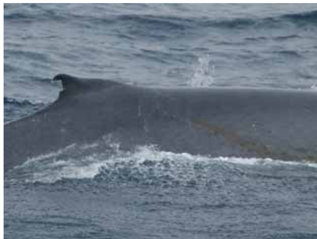
Figure 2. Whale B1069 sighted in Area IV on 1 February 2006. The whale was identified by the particular shape of the dorsal fin.