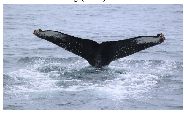
Caudal fin of a humpback whale photographed near the Aleutian Islands (2022)