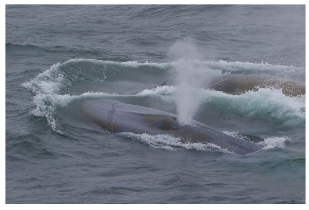
Blue whale breathing at sea surface (2022)

Photographs from previous IWC-POWER cruises (Copyright IWC/ICR).