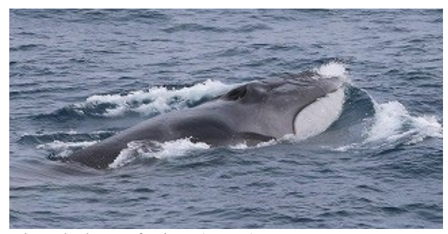
Fin whale surfacing (2021)