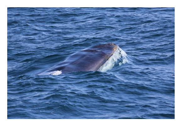
A fin whale, the most frequently sighted whale species.