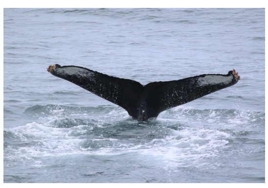
Fluke-up humpback whale.