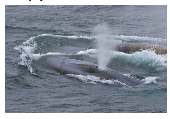
Surfacing blue whales.