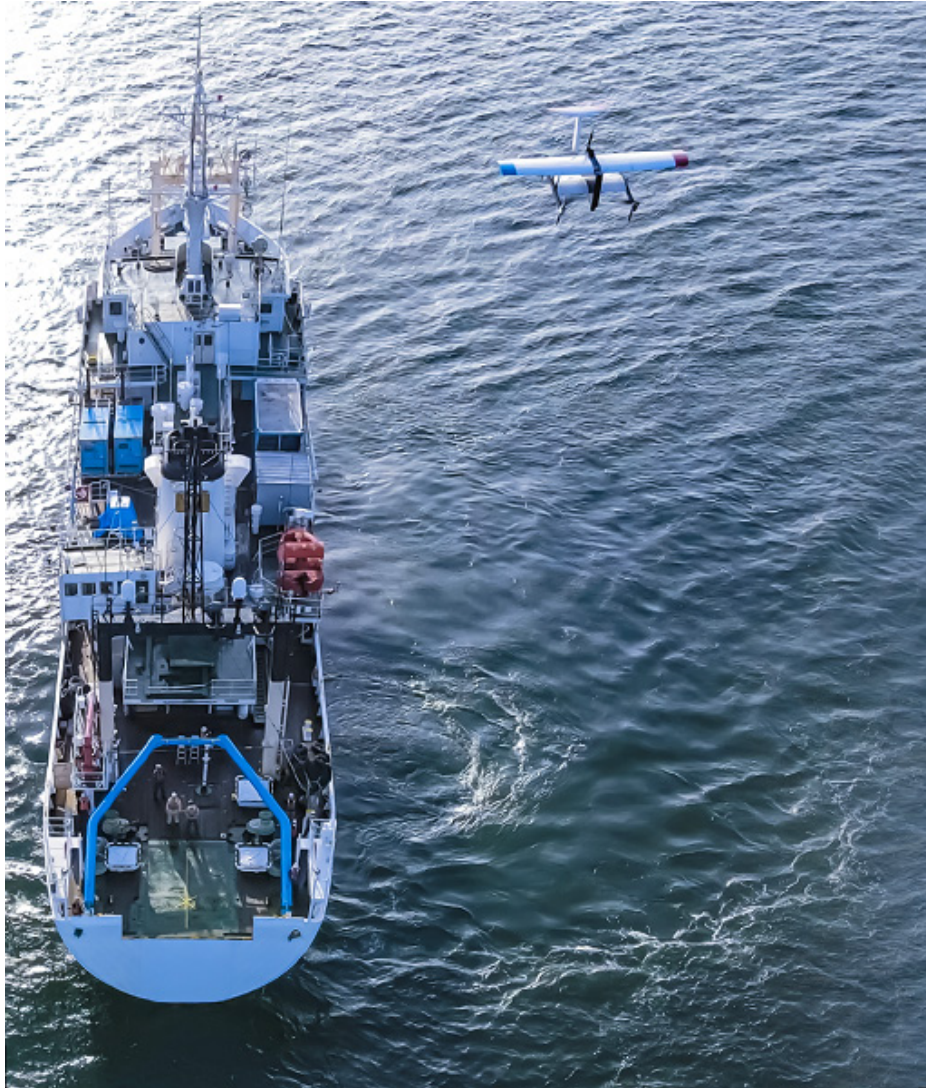
Photo 2: VTOL-UAV “ASUKA” undergoing vertical take-off and launch from the research vessel