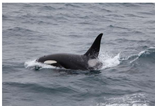
d) Killer whale dorsal fin