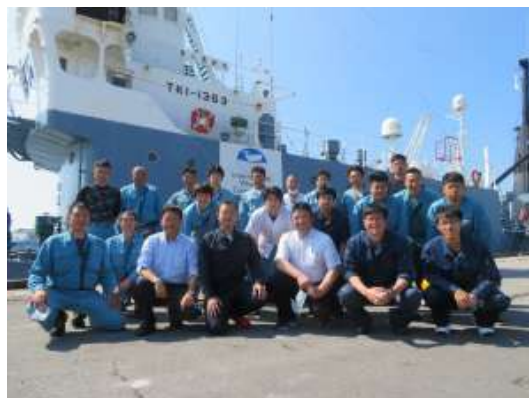
f) Yushin-Maru No. 2 crewmen and researchers (Kushiro Port)