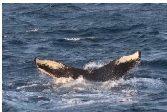
c) Humpback whale caudal fin (ventral side)