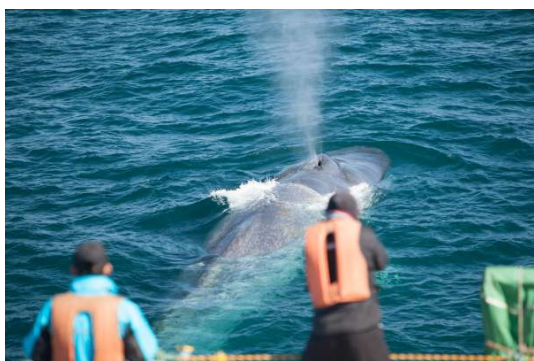
a) Biopsy sample collection from blue whale