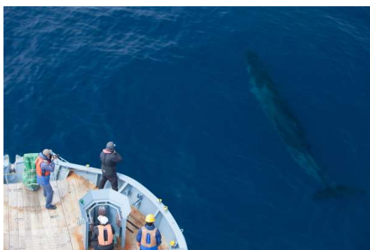
b) Biopsy sample collection from sei whale