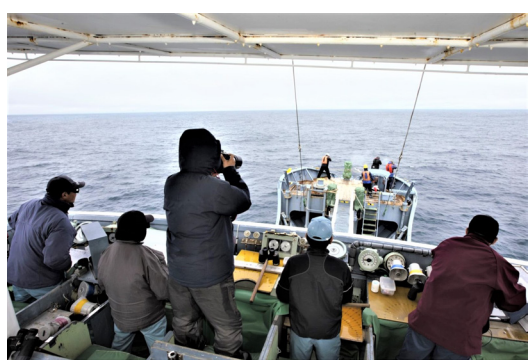
e) View of a biopsy sample collection experiment from the upper bridge