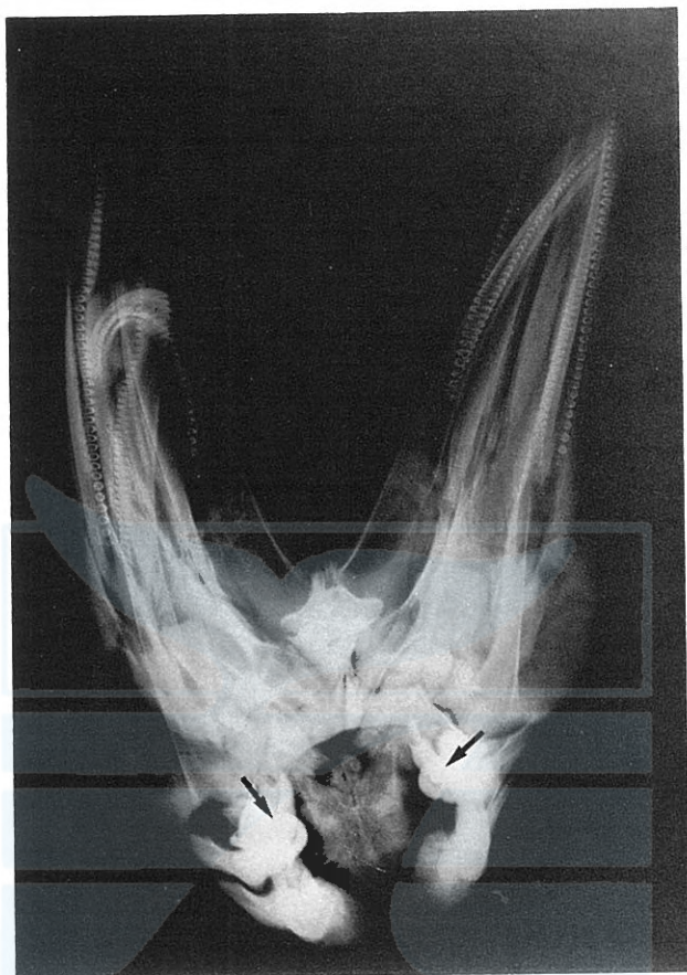
Fig. 2. An X-ray photograph taken in dorso-ventral direction. Arrows show the petrous bones. It can be noted that the skull-cap is unformed.

We wish sincere thanks to Prof. P. Pirlot, Université de Montréal, for critical reading of the manuscript.